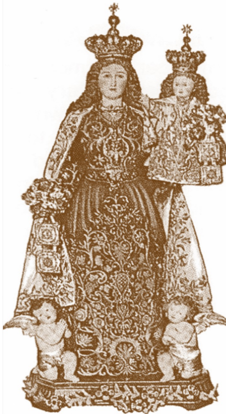
THE SCALABRINIAN MISSIONARIES AT MOUNT CARMEL SINCE 1905