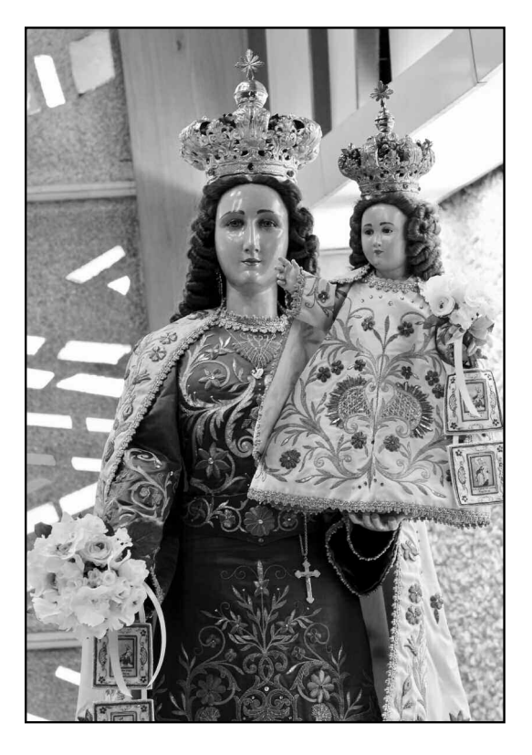
Our Lady of Mt. Carmel Honored in Melrose Park, III.